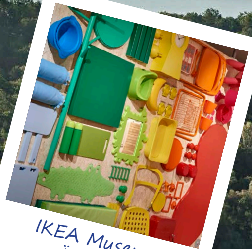
IKEA Museum Älmhult