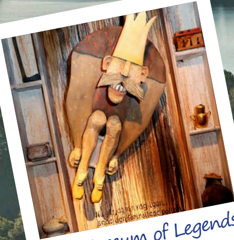
The Museum of Legends Ljungby

SEK 780 for 4 family tickets (reg. SEK 985)