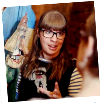
The Museum of Legends Ljungby

Fantastical tales and legends of trolls and elves, water sprites and forest nymphs, mares and ghosts have amused and frightened people throughout history. The Museum of Legends in Ljungby brings to life the oral storytelling tradition of Sweden. Guided tours are offered daily at 12:00 p.m. and 2:00 p.m. and are included in the entry fee.